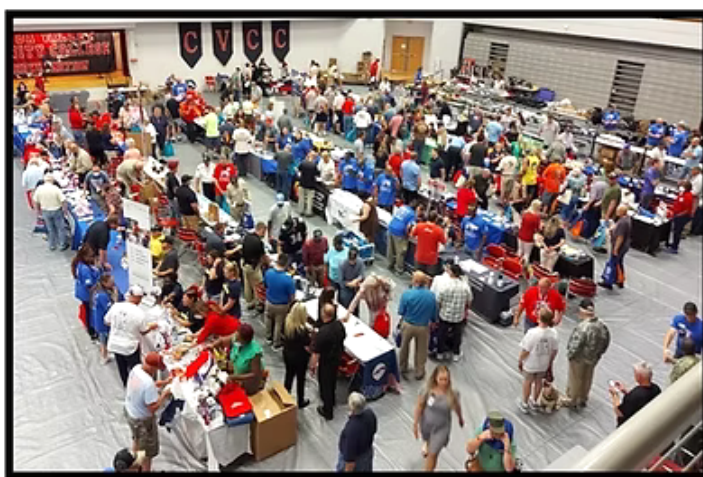
Foothills Veterans Stand Down event from a previous time

As previously stated, we've added two local charities to our Benevolent Fund. The Statesville-based Piedmont Veterans Assistance Council (PVAC) provides assistance to struggling and homeless Veterans through transportation, access to food, housing and employment resources, and support with critical needs. Thus, providing the means for homeless Veterans to transition to being full-fledged, productive members of society. PVAC is partnered with several other organizations, such as Purple Heart Homes (PHH) which is now building tiny homes (pictured to the left) to expand capacity at PVAC's Veterans Transition housing facility. The Foothills Veterans Helping Veterans organization is based in Hickory. They conduct two huge indoor "Stand-down" events each year (pictured to the left), providing an amazing spectrum of on-scene services and clothing directly to Veterans, with special focus on homeless Veterans. We've been a major sponsor of past Stand Down events; so, rather than an ad hoc involvement, it's now one of our chapter's permanently designated charities.