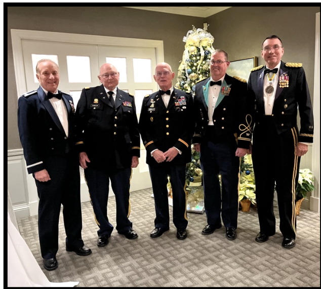
Some of the officers at our Christmas dinner event

President's Day Commander-in-Chief February 17 th